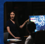
Language & Business Etiquette Training in ASEAN Countries