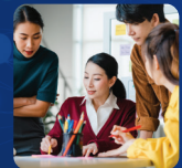
Cultural Exchange Program (Student Mobility)